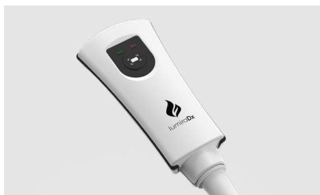
LumiraDx Barcode Scanner