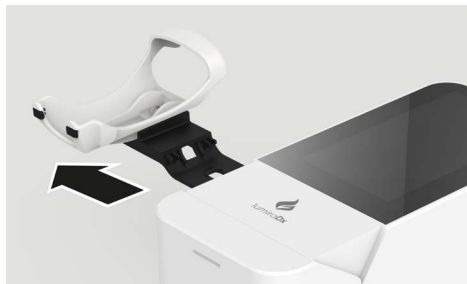
Detaching LumiraDx Barcode Scanner cradle from Instrument