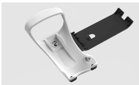
LumiraDx Barcode Scanner cradle