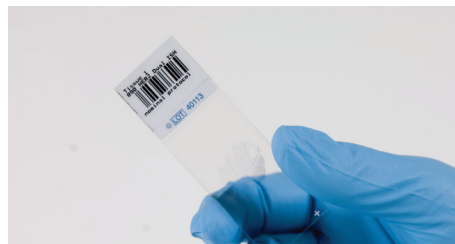
Slide-specific label provides automatic programming, patient and case identification

Ensure the right test for the right patient with reagent- and slide-specific barcode labels that fully automate protocol runs, and aid patient and case identification. When integrated with the Laboratory Information System, you can increase laboratory productivity and reduce potential errors by eliminating redundant data entry.